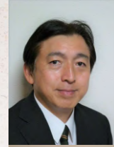
President of BSC Japan

In this meeting, we would like to have lectures by doctors who are active in the front line of research and development of advanced medical treatment and clinical practice, to organize the merits and demerits of new treatment by technological innovation, and to discuss the sound development of orthodontic practice from a global perspective. We sincerely look forward to your participation.