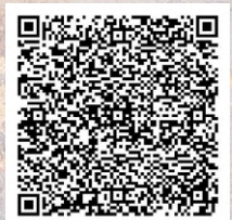
Break fast package