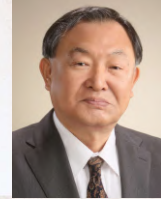
Chairman of The Conference